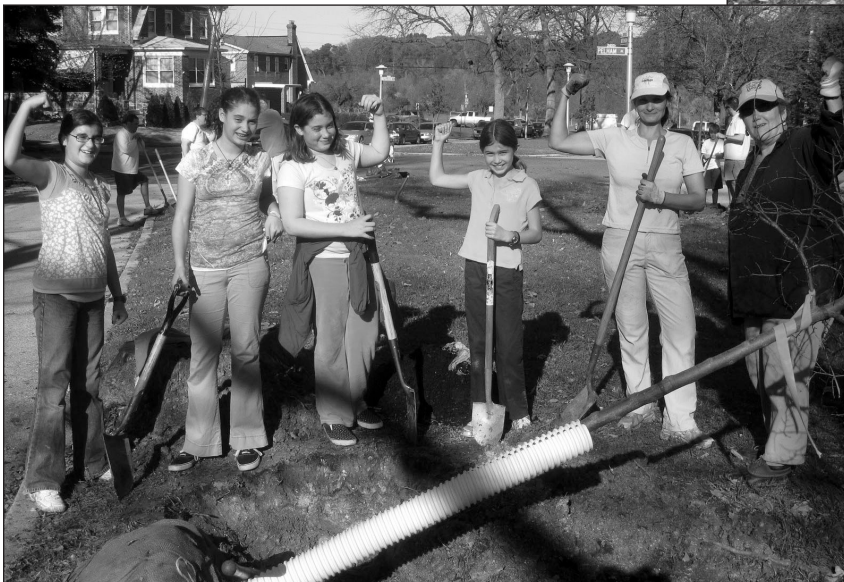
Girl Power (left): Team of women and girls took great pride in planting this tree with sheer will and girl-power.